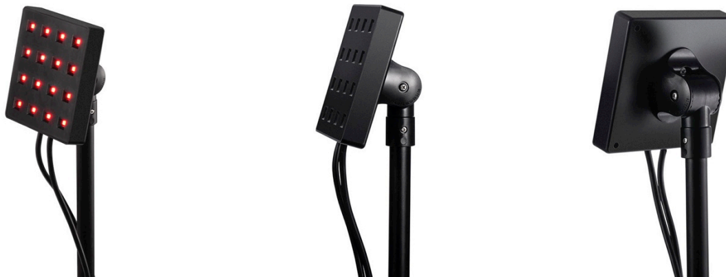
DP1201603 - DP1201616 DMX STADIUM PANEL