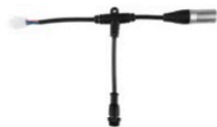
T Connector for Signal&Power NWT5XM4F2M ORDER CODE: UNINWT5XM4F2M