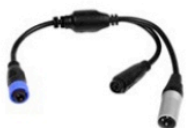
T Connector for Signal&Power 67T5XM4F2M ORDER CODE: UNICPL67T5XM4F2M